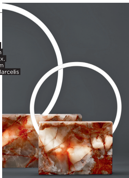
Table lamps contrast delicate rings of neon light with natural onyx. Voie table lights , from £1,167 each, Sabine Marcelis for Bloc Studios

The pink trend has now crossed over into marble with this pastel onyx design. Tebe tables , price on request, Baxter