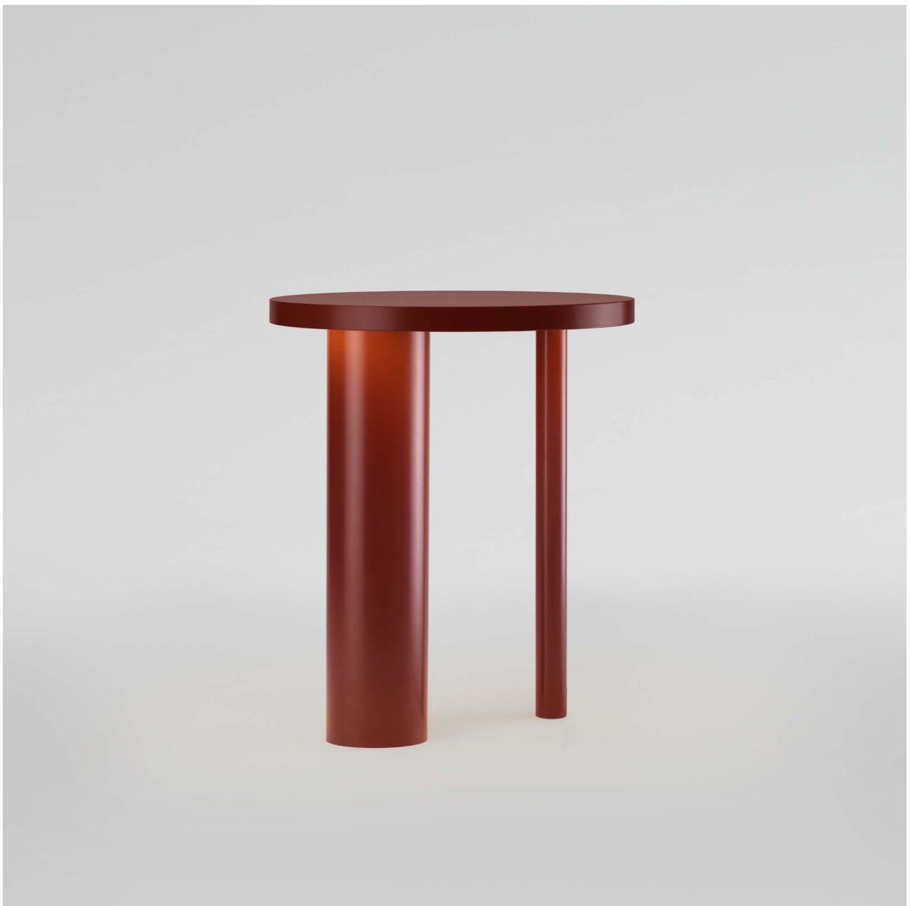
Table Composition, 2017