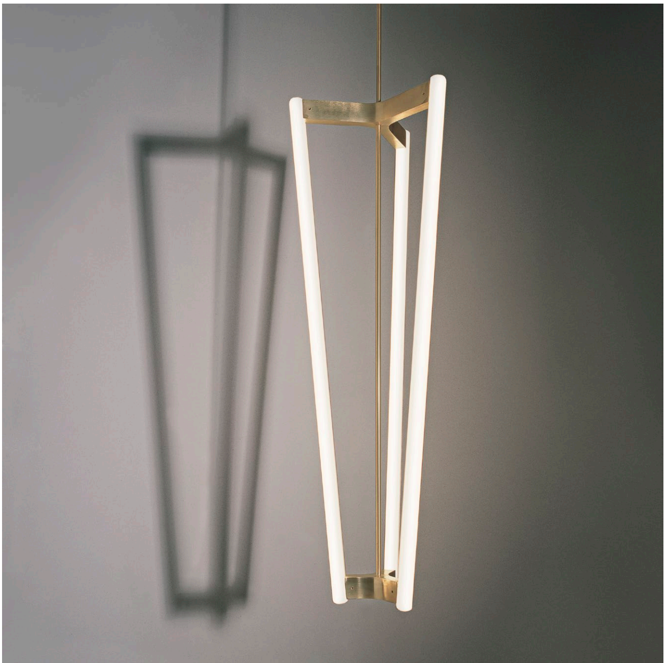
Tube Chandelier, 2006